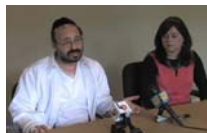
Interview with New Square arson victim Jun 22, 2011