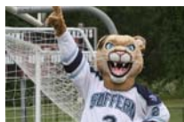
Wanted: mascot, announcer, singer. Appl... Jun 12, 2011